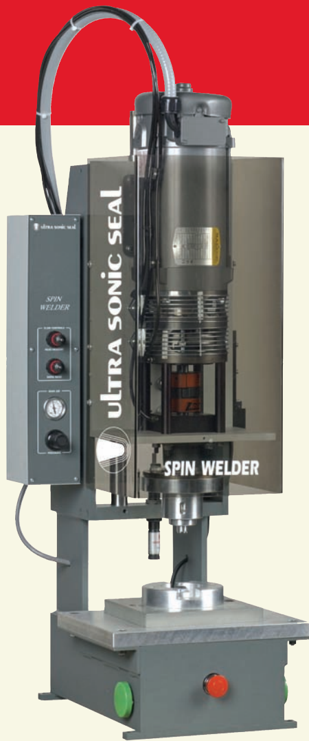
Model 1010 Spin Welder