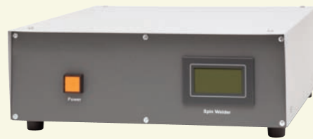
SPX Power Supply